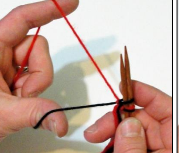
6. Go under DC yarn coming off front of thumb and down to hand, creating a loop.

7. Catch LC yarn and pull back through loop.